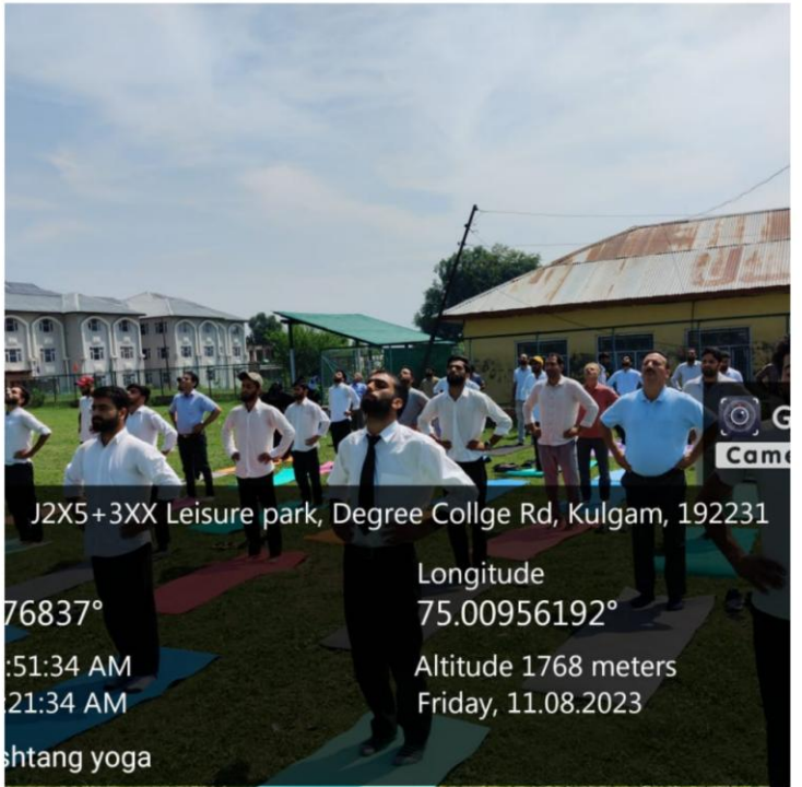
J2X5+3XX Leisure park, Degree Collge Rd, Kulgam, 192231