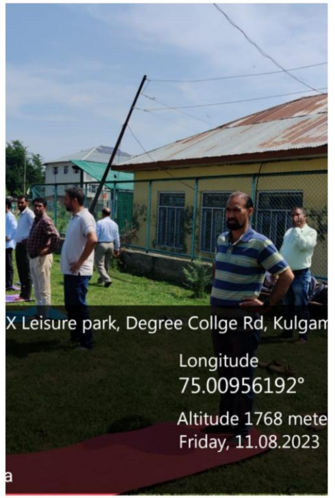
J2X5+3XX Leisure park, Degree Collge Rd, Kulgam